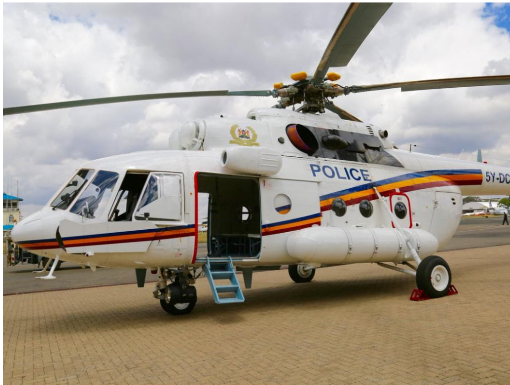
The Mi-17V-5 multi-role helicopter delivered by a Russian company to the National Police Service, March 29, 2017.

"The Mi-8/17 type helicopters offered to African clients are intended primarily for the use in civil aviation, to transport cargo and passengers, including VIPs," read a statement by the media relations department of Russian Helicopters.