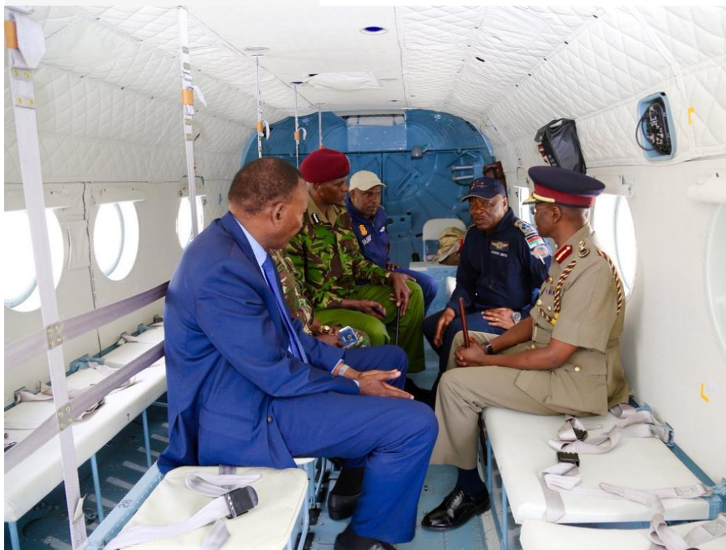
Interior CS Joseph Nkaissery, IG Joseph Boinnet and other officials in the Mi-17V-5 multi-role helicopter delivered by a Russian company to the National Police Service, March 29, 2017.