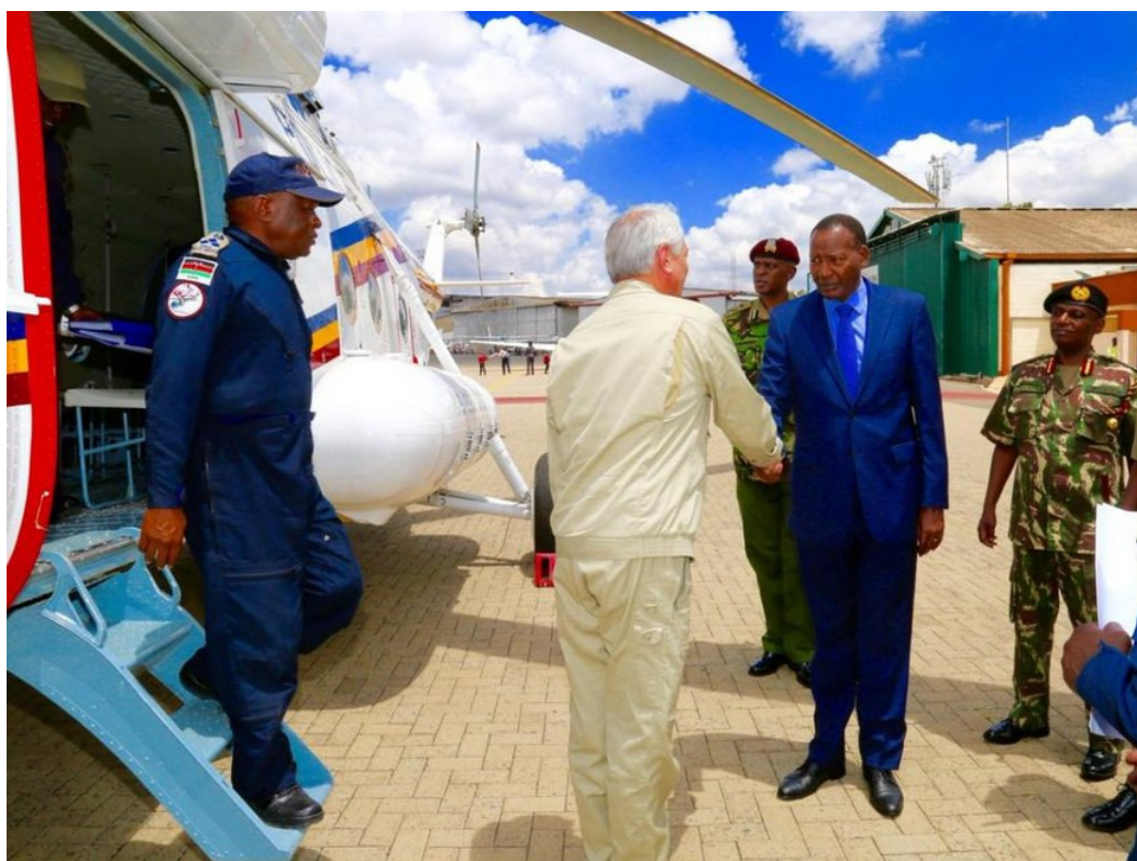
Interior CS Joseph Nkaissery witnesses the formal handover of the Mi-17V-5 multi-role helicopter from a Russian company to the National Police Service, March 29, 2017.